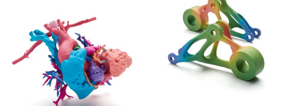
Data courtesy of Phoenix Children's Hospital: Heart of Jemma