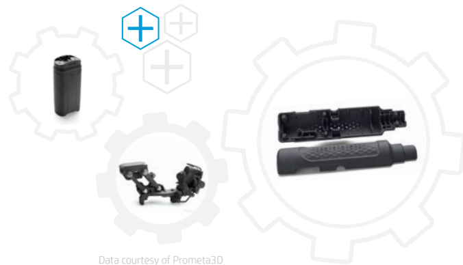
Data courtesy of Prometa3D

Certifications: Biocompatibility, 9 REACH, RoHS (for EU, Bosnia-Herzegovina, China, India, Japan, Jordan, Korea, Serbia, Singapore, Turkey, Ukraine, Vietnam), PAHs, Statement of Composition for Toy Applications, UL 94 and UL 746A Certification