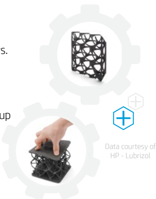
Data courtesy of HP - Lubrizol

Tested and approved solely for compatibility with HP Jet Fusion 3D printers 14