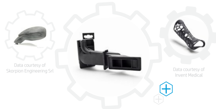
Data courtesy of Skorpion Engineering Srl